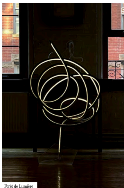
Forêt de Lumière