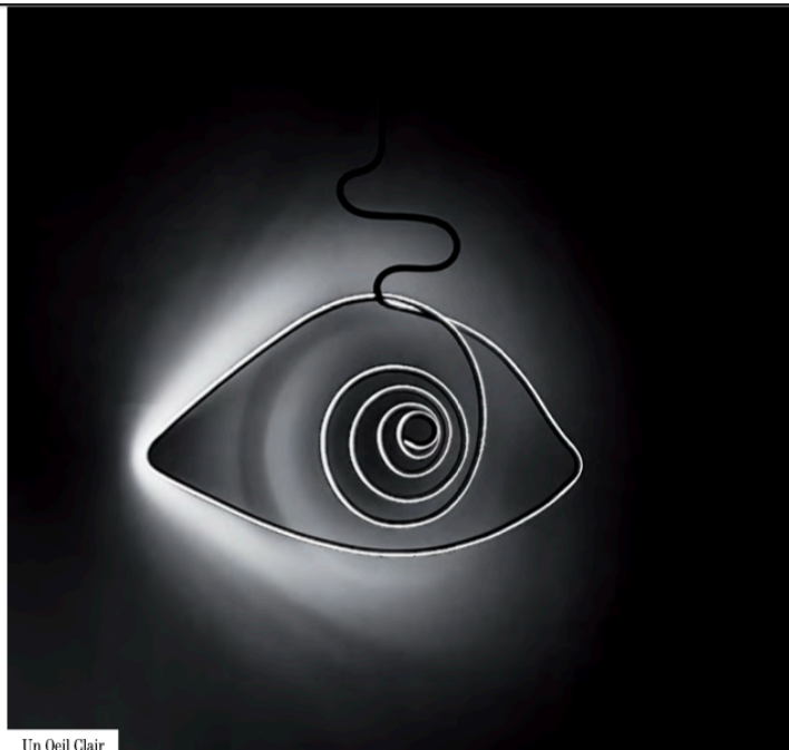
Un Oeil Clair